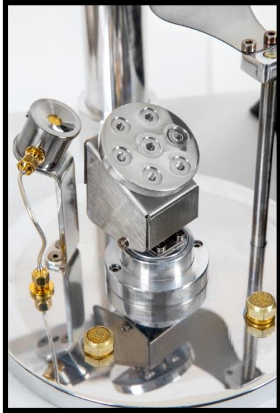
Rotary planetary sample stage