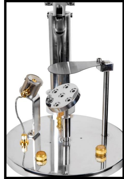
Standard sample stage

The DSR1 can be equipped with different sample stage configurations depending on the user requirements. The standard sample stage is rotatable with adjustable height, angle and can be changed easily.